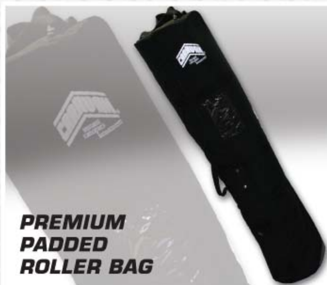
PREMIUM PADDED ROLLER BAG