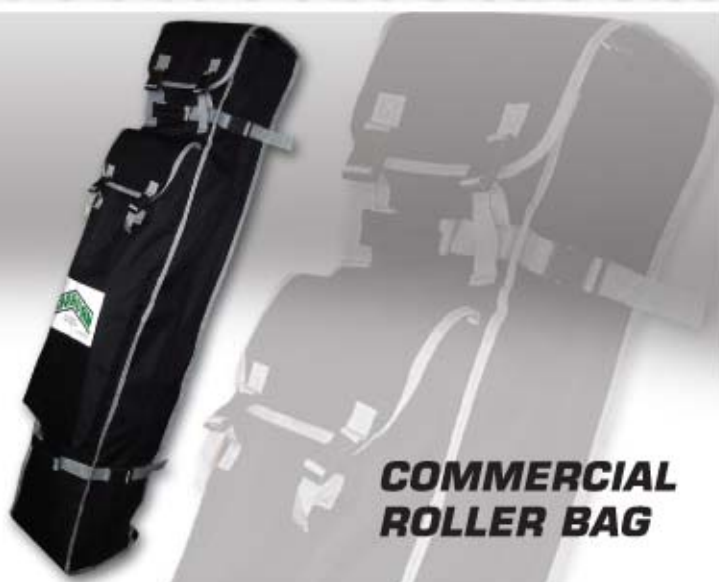
COMMERCIAL ROLLER BAG