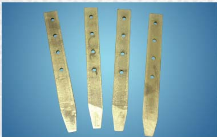
COMMERCIAL STAKE KIT